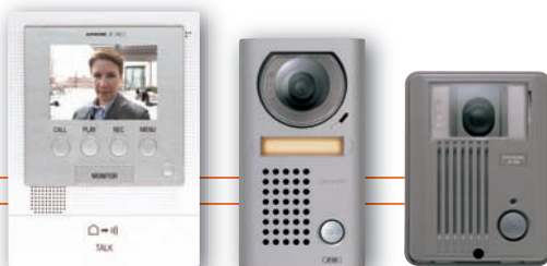
JF Series Hands-free Color Video