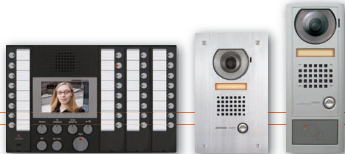
AX Series Integrated Audio/Video Security